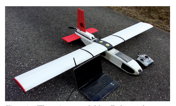
Figure 1 — The equipment used: Maja-D drone, a laptop containing a telemetry link as ground station, and the remote control.

In order to assess whether drones can be used to map human winter activities in protected mountainous areas, we investigated: (1) which technical, aeronautical and environmental conditions allow accurate