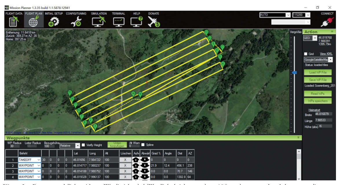
Figure 3 – Programmed flight grid over Wagliseichnubel. The flight height was about 100 m above ground and the transect lines were approximately 100m apart.