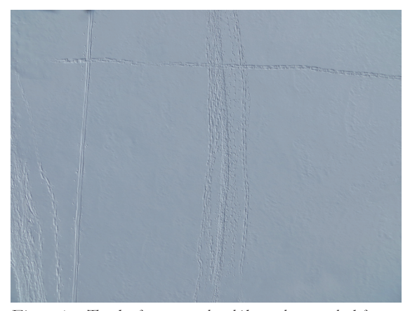
Figure 4 – Tracks from snowshoe hikers photographed from a flight altitude of about 100 m.

people per day use the official route. Considering the length of the route and the number of tracks left in the snow, those deviating from the official route represent only rare cases.