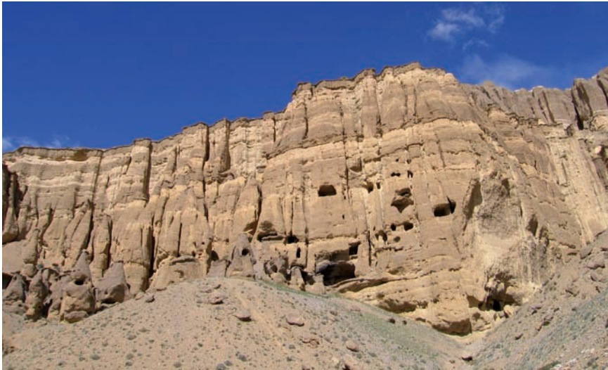
24. Cliff with the Bar rdzong cave complex

including Ṣaḍakṣarī-Lokeśvara and Tārā. The interior decoration indicates strong links with new religious concepts of Tibetan Buddhist schools in Central Tibet. The latter, such as the 'Bri gung bKa' brgyud pa (pr. Drigung Kagyüpa) appeared in Western Tibet from the 13 th century onwards.