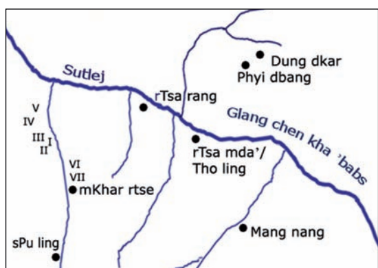
I (Old) Khartse Village (winter place), II Khartse Monastery, III Nyag Cave, IV Brag rdzong Cave, V lCang lo can Cave, VI mKhar rdzong Cave, VII Bar rdzong Cave Map 2. Sites in the Khartse Valley, Western Tibet

The upper southern part of the valley is a high-altitude region (4,300 m) and is the ‘summer place’ ( dbyar sa ) of the local population. It contains the mKhar rdzong (pr. Khardzong) (Map 2: VI) and Bar rdzong (pr. Pardzong) (Map 2: VII) cave sites. The transition between summer and winter place is marked by the seat of three female local deities ( yul lha ).