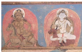
25. Detail of dikpāla in the lowest frieze: Kubera (Lus ngan po) and Īśāna (dBang ldan)

In these religious traditions the teacher, or hierarch of the individual order, and his idealized portrait surrounded by monks of his school plays a central role. Such images are accompanied by specific iconographic programmes and deities associated with their belief systems. Most of the paintings of the deities in the sanctuary are accompanied by brief inscriptions and captions.