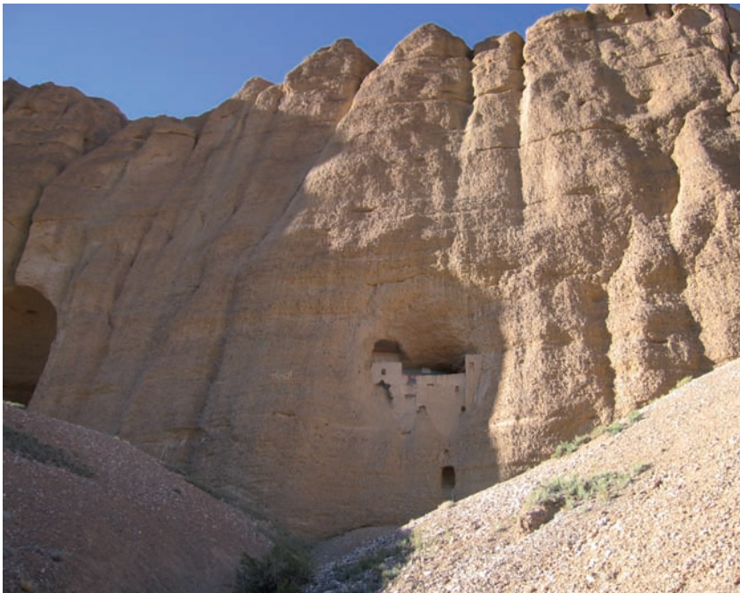
36. Brag rdzong cave complex

Another cave complex, located to the north-west of Old Khartse Village, houses the so-called Brag rdzong Cave Temple, which also faces south (Fig. 36). The layout of the cave shows a courtyard and an adjoining main hall. The measurements of the latter are 4.8 m on the east-west side and 2.66 m in north-south side. The height of the hall is 2.28 m (in the corners 2.24 m). The entrance wall has two portals, giving access to a rectangular room. When entering the cave, one sees the longer northern