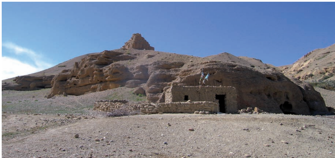
15. Sacred landscape near the Nyag cave with the stupa on the ‘scorpion’s pincer’

The site lies at an altitude of 4,035 m and can only be reached on horseback or on foot. An image of the surrounding sacred landscape shows the hill crowned by a ruined stupa ( mchod rten ) lying on the right pincer of the scorpion, while the cave secures its left pincer (Fig. 15). In front of it is a building,