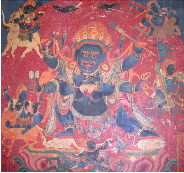
34. Mahākāla, south wall

forms of Mahākāla. Depicted above the portal are further protective deities ( srung ma ). In the lower corner we can also see figures of donors with lotus flowers as offerings, possibly commemorating the act of consecration.