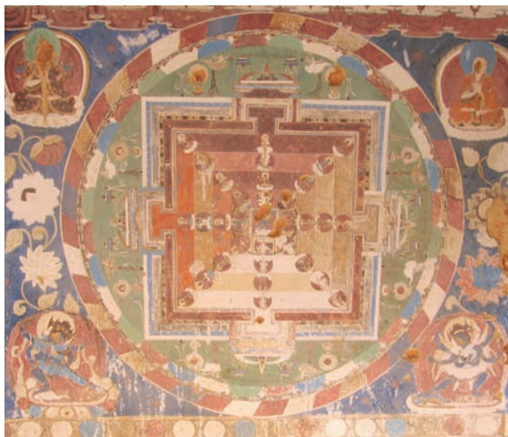
42. Mandala on the west wall

wall is a mandala (Fig. 42) displaying in its upper left-hand corner a portrait of the important religious master Tsong kha pa ( rje Tsong kha pa chen po according to the caption), who lived from 1357–1419 and was the founder of the dGe lugs pa School, the diffusion of which to Western Tibet started in the