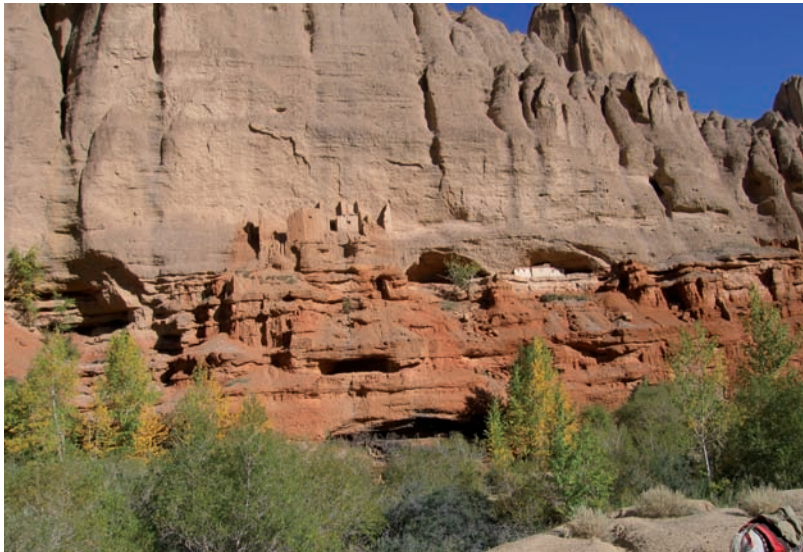
41. View of the Cang lo can (pr. Jang Lojen) caves and the castle above

To the north of Old Khartse village is a cave sanctuary which the mKhar rtse people refer to as lCang lo can cave (Fig. 41). A river meandering through the valley below is the lifeline which irrigates a small forest. Above is the south-facing cave lying hidden behind the ruins of the monastery. Unfortunately