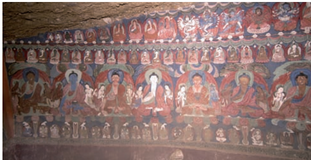
38. Eight Medicine Buddhas as main icons of the north wall