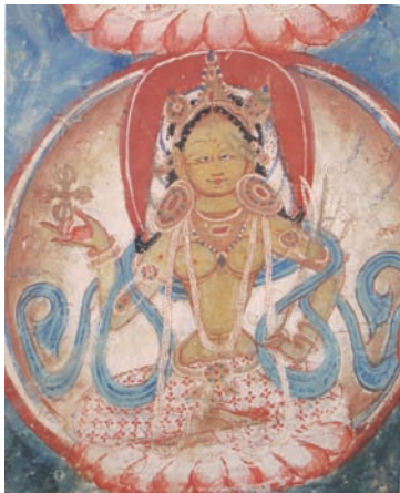
23. Detail of a female deity, south wall

to Mang nang and the Tabo Main Temple (Renovation Phase, mid-11 th century), suggesting that Nyag Cave Temple images date to the mid-11 th century. This horizontal execution of the programme contrasts with the composition of deities in a geometric mandala palace – corresponding to a tendency towards vertical hierarchy in the symbolism of the spatial iconography (also reflected in architecture) of later periods – which can likewise be found in the ca. mid-12 th century Dung dkar caves. The iconographic features of the types of mandala depicted in the Nyag Cave Temple have already been discussed by a number of authors (cf. Pritzker 2008). We will therefore concentrate here on the stylistic attribution, chronology and some hitherto little discussed features.