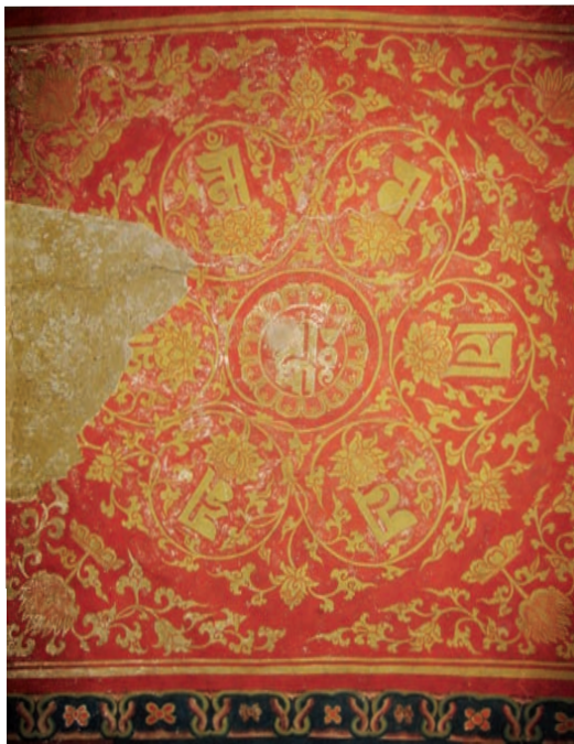
35. Ceiling, central panel showing a flower rosette containing the Avalokiteśvara mantra oṃ maṇi padme hūṃ hrīḥ

The origins of dragon and phoenix lie in ancient Chinese astrologic and geomantic traditions and are equated with the celestial directions. These panels are shown in alternation with textile patterns and images of the Eight Auspicious Signs ( bkra shis rtags brgyad ). This interest in textiles covering the ceiling alludes to an honorific cover 22 which is consistently present in the early phase of Buddhist temples in the region from