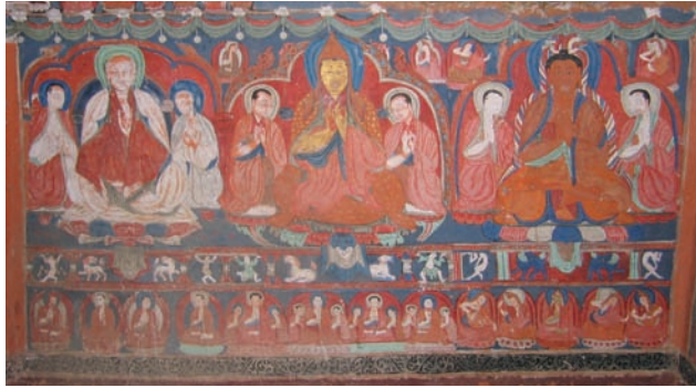
37. Portraits of religious masters, east wall