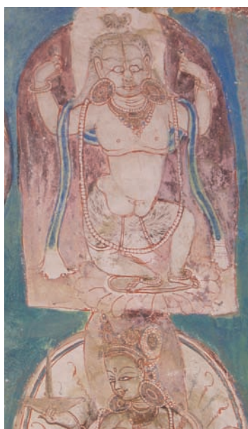
21. 'Gate-protector', mandala, north wall

Focusing on the visual material of lay imagery, the courtly riders on elephants with their mahouts and horsemen in the lowest register of the composition, as well as their costumes, textiles and regalia provide an enormously rich resource, especially for studies of material culture, chivalric tradition and the culture of status. The courtly train possibly echoes the courtly pride of aristocracy in north-west India. Comparable characteristics are to be found in the frieze featuring the life of the Buddha at Tabo. Representations of elephants with riders were a common motif in Indian art representing high ranking or princely devotees who have come to worship the Buddha.