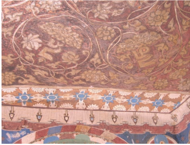
43. Ceiling detail: Avalokiteśvara mantra oṃ maṇi padme hūṃ hrīḥ in the centre framed by textile patterns and valances

between the central mandala and flanking deities on the same wall is probably a portrait of the donors.