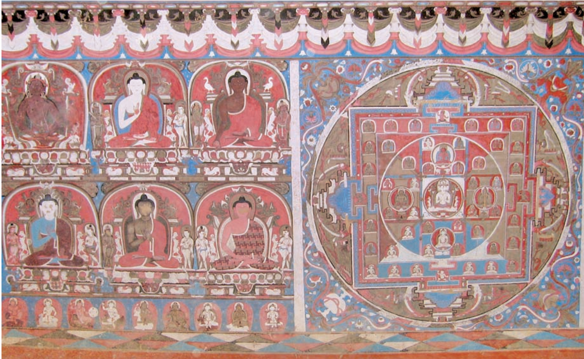
28. Iconographic configuration on the west wall showing (from left to right): Vasudhārā (in the upper register), Nāgeśvararāja (below), Medicine Buddhas, mandalas and dikpāla in the lowest frieze

resides (Bröskamp 2006: 265). However, crystalline rocks and sacred trees defining divine abodes are a common and typical feature of Central Tibetan art from very early on.