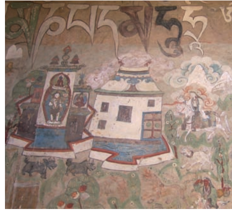
11. Wall painting featuring the monastery where the Jowo ( jo bo ) resides and a procession of the 'three sisters' (local tutelary deities)

A lock and a key are also said to date from the time of Rin chen bzang po, and people believe it was the private lock that he brought back from Tholing before he died (Fig. 10). The monastery's murals – painted in a rather simple local style – show an important image of the local sacred landscape, featuring the Jowo, together with depictions of three local deities ( yul lha ) who are conceived as 'sisters' and regarded as protectresses of the area (Fig. 11). The murals featuring Buddhist images are also from a rather late phase (17 th /18 th century?) but – in contrast to the historic depiction of the sacred landscape – they are executed in an elaborate and refined style displaying strong Chinese-style tendencies.