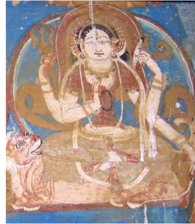
19. Yakṣi (Rūpavajrā?), entrance wall, left-hand side

graphic treatment of facial elements with large, fish-shaped eyes. The static posture and frontality emphasizing the iconic, transmundane nature of the Hārītī figure (Fig. 17) also tends to preserve the memory of the Indian models, a characteristic which stands in contrast to the interest in naturalistic movement and interaction between figures in later Kashmiri-style images displaying post-Gandhāran features that are displayed in later (12 th –13 th century) temples at Nako and Dungkar.