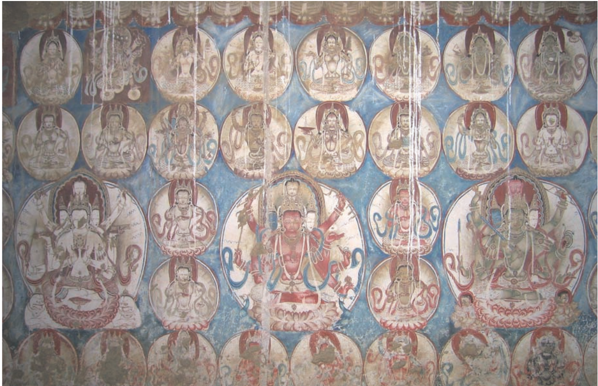
22. Dharmadhātuvāgīśvaramaṅjuśrī mandala, south wall