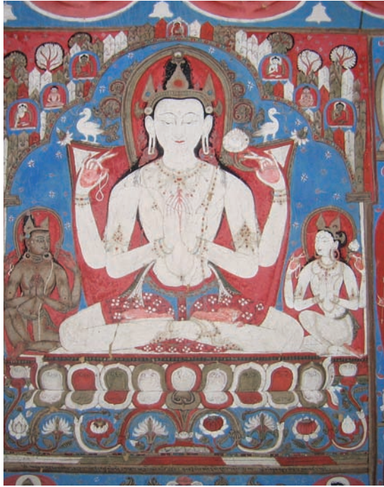
27. Śaḍakṣarī-Lokeśvara (east wall)

adepts who have attained perfection – positioned at the sides of the paintings, while protector deities are usually positioned in the lowest zone. This type of strict hierarchic composition became a dominant convention of Tibetan painting in later periods.