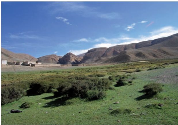
3. Landscape around Khartse Village area (summer place)

(mKhar rtse) 3 Valley (see Pritzker 2000, von Schroeder 2001, Pritzker 2008). Explorations in this valley carried out by Tshe ring rgyal po since 2002 have not only brought to light the existence of further hitherto unknown Buddhist sites (see Tshe ring rgyal po 2006). They also revealed that the monuments, paintings and objects preserved there represent important examples of a wider historical Western Tibetan Buddhist tradition dating to periods between the 11 th and 19 th centuries. Moreover, finds of texts and artefacts or other religious items from different epochs also reflect the historical development of the various sites of importance for their Buddhist and art-historical heritage. This wider cultural and artistic perspective therefore constitutes the comparative focus of the present paper. Based on the field research conducted by Tshe ring rgyal po, this article provides a first assessment of the previously almost unknown Buddhist monuments in the Khartse Valley in terms of their historical and art historical value and presents a survey of