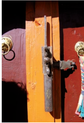
10. Rin chen bzang po's lock on the entrance door