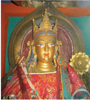
9. The Jowo ( jo bo ) Avalokiteśvara bronze sculpture reflecting a Kashmir-style trend in the 11 th century