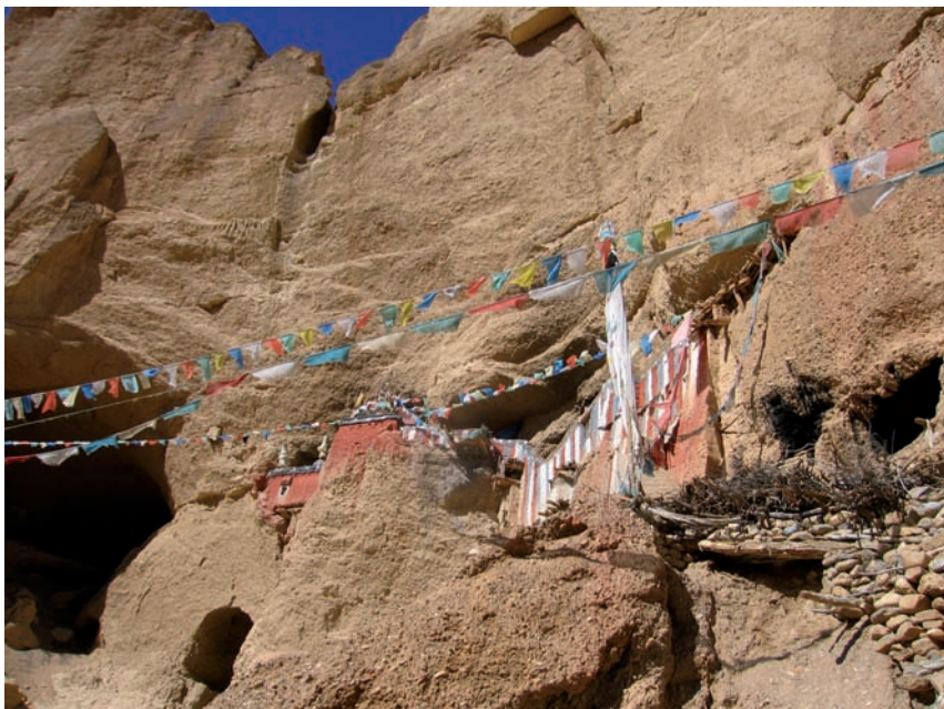
8. View of the cliff with Khartse Monastery

Khartse is most famous for the Jowo statue, which dwells in a prayer hall of a cave complex in the cliffs (Figs. 8 and 9). It is well known throughout and beyond Western Tibet, and must have been a focus of pilgrimage since arriving in the area. According to his hagiography, Rin chen bzang po returned from