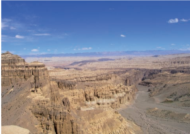
1. View of Tsamda area from Khartse