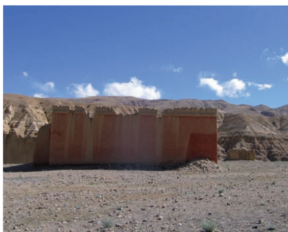
13. Ruins of the monumental Nyag Temple (Nyag lha khang), view from north

This impressive monument is situated on a large plain in the valley. The structure measures roughly 15 m from east to west and 7 m from south to north. The massive cube-like shape of the construction is in the tradition of Western Tibetan temple architecture with a combination of stone rubble, timber and mud bricks, adapted to the harsh climatic and seismic conditions of the region. The Tabo Main Temple ( gtsug lag khang ) shows a comparable typology and dates from the same historical phase. The ground plan of the Nyag Temple includes an entry chamber ( sgo khang ) in the east leading to the Assembly hall (‘ du khang ), which has a sanctum ( dri gtsang khang ) with ambulatory ( skor lam ) in the west. The monument once contained clay sculptures which were affixed to the walls. A view of the south wall of the cella (Fig. 14) shows that very little of these deities, mainly their haloes, is still visible. The figures probably once formed a mandala configuration. This iconographic and compositional scheme characteristic of the period from the mid-11 th century onwards contrasts with the monumental standing Bodhisattvas flanking the main icon in the cultic centre of Tabo which stems from an earlier, Central Tibetan-influenced phase at the end of the 10 th century (Jahoda and Papa-Kalantari 2009). It is said that ten years ago some parts still had paintings, and in fact traces