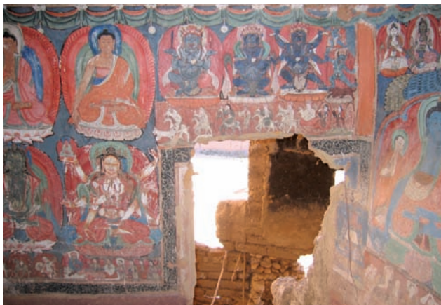
40. Configuration on the left-hand side of the entrance wall with figures of group of 16 Arhats, below 7 Buddhas and 5 Tathāgatas and local deities above the right door

neither are there any images of dGe lugs pa monks; but in the lowest line we find masters with hats indicating a 'Bri gung pa lineage. The colours red and black predominate in the colour scheme, with additional use of gold for the skin of the teacher. In general the figurative style is rather schematic and stereotyped as compared to the visually and technically complex artistic idiom discussed above, but the line drawing is dynamic and sophisticated and can be ascribed to a skilled master.