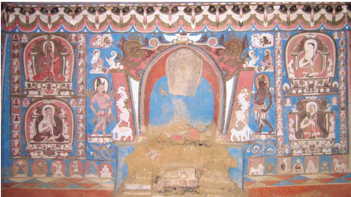
26. Main wall, central icon flanked by four eminent teachers

Significant artistic features of the paintings in the Bar rdzong cave, in contrast to the earlier paintings of the Khartse Nyag Cave Temple, include compositional units recalling thangka depictions. They are characterised by a complex and strictly hierarchic layout of a main icon with smaller attendant figures turned towards the main deity, often the hierarch of the school, which reflects a distinctive phase of religious concepts. Among the key features of this trend is the representation of the spiritual lineage and in particular the Eight Great Siddhas – Buddhist