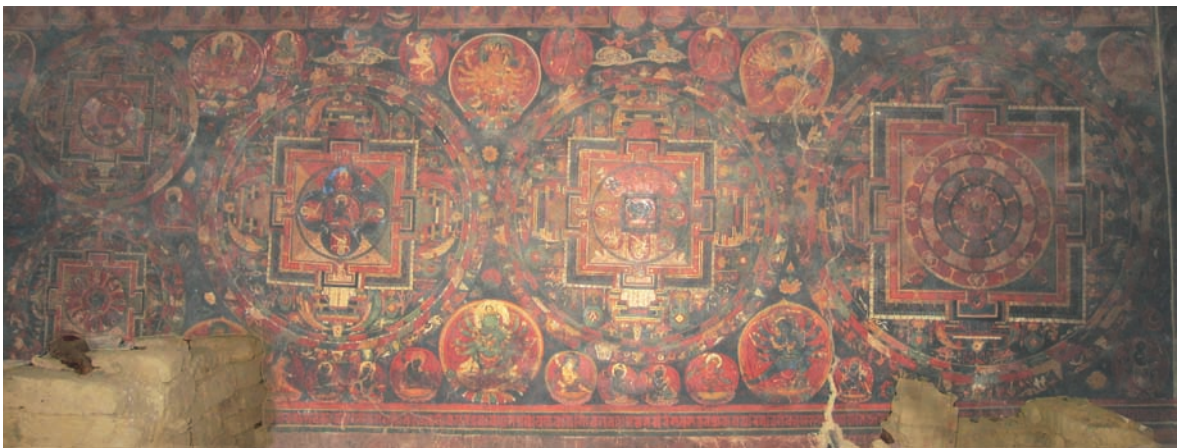
33. Row of five mandalas, west wall

On the entrance wall (southern wall) there are wrathful protectors (Fig. 34): in the upper left-hand corner resides Mahākāla, performing a dynamic side step. He holds a kapāla and chopper in his hands before his breast. Below him is represented the lokapāla Vaiśravaṇa (rNam thos sras), the Guardian of the North and protector of wealth and treasures. To his right is Yama and different