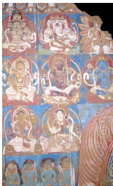
16. Protective deities on the left-hand side of the entrance wall, organized in simple registers

Of specific interest is a group of female deities ( yakṣiṇī ) depicted in a lower register, which has not yet been identified in other temples from this artistic phase: one of them is shown with a flower and an overflowing vase ( pūrṇakalāśa , gter gyi bum pa ), resting on two lions as vāhana ; the vase