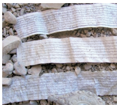
31. Fragments of manuscripts found in the cave

comparable with that of the previously discussed cave, stylistic characteristics point to a later, 14 th /15 th -century date. Facing south, the cave is located fairly high up, at about 200 m from the bottom of the cliff, and is accessible through stairways cut into the rocks forming internal shafts. A courtyard is located in front of the main sanctuary. The cave is unique as it preserves a programme with the ceiling decorations intact. In contrast to the subdued colours and restricted palette in the earlier Bar rdzong cave temple, here intensive colours predominate, with generous use of dark red, dark blue pigments as well as gold (Figs. 29 and 30).