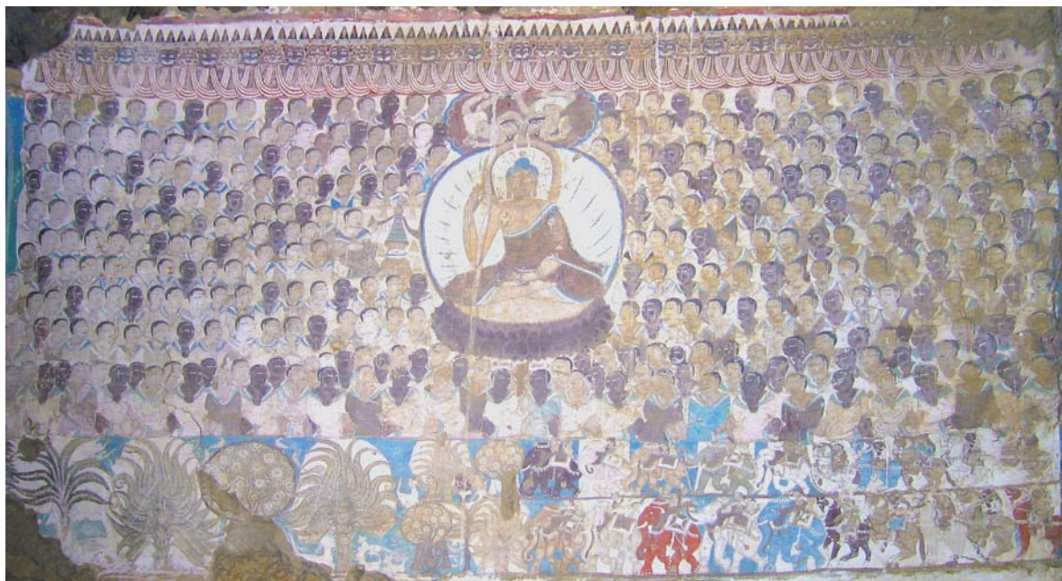
20. Large composition featuring a veneration of the Buddha (right-hand section of the north wall)

A striking monumental composition on the north wall featuring a teaching Buddha Śākyamuni in the centre (performing a variation of the vitarkamudrā ) (Fig. 20) may yield important clues to the belief system of that time. He is seated on a lotus throne ( padmāsana ), flanked by a large number of monks in attitudes of veneration. One of the monks is depicted in a prominent position to the left of