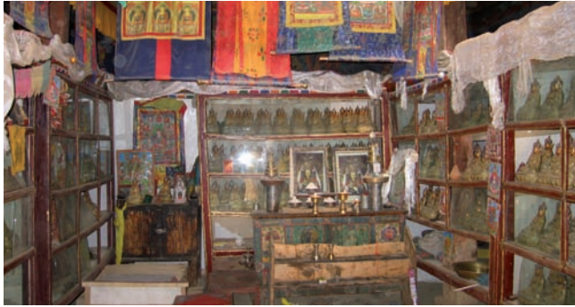
6. Chamber with Buddhist sculptures and thangkas, Maitreya Temple (Byams pa lha khang)