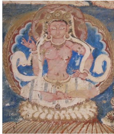
18. Nāginī in a group of serpent spirits, right-hand side of the portal, above the halo of the gate-protector