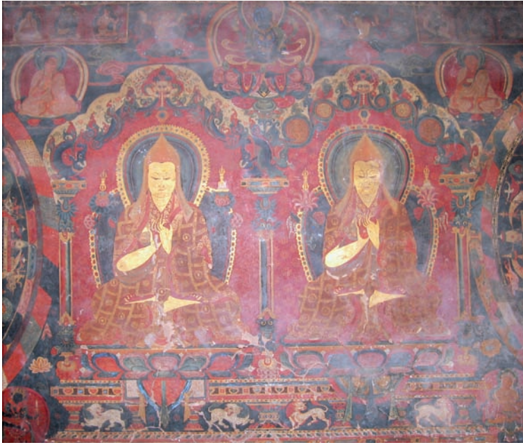
32. Double portrait of a religious master (Bu ston Rin chen grub?), north wall

ornaments of a bodhisattva, with hands crossed before his breast holding two vajra as a key element. The deity is surrounded by a field of lotus flowers and is encircled by a rainbow.