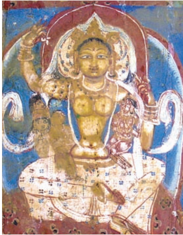
17. Protective divinity (Hārītī), entrance wall, left-hand side