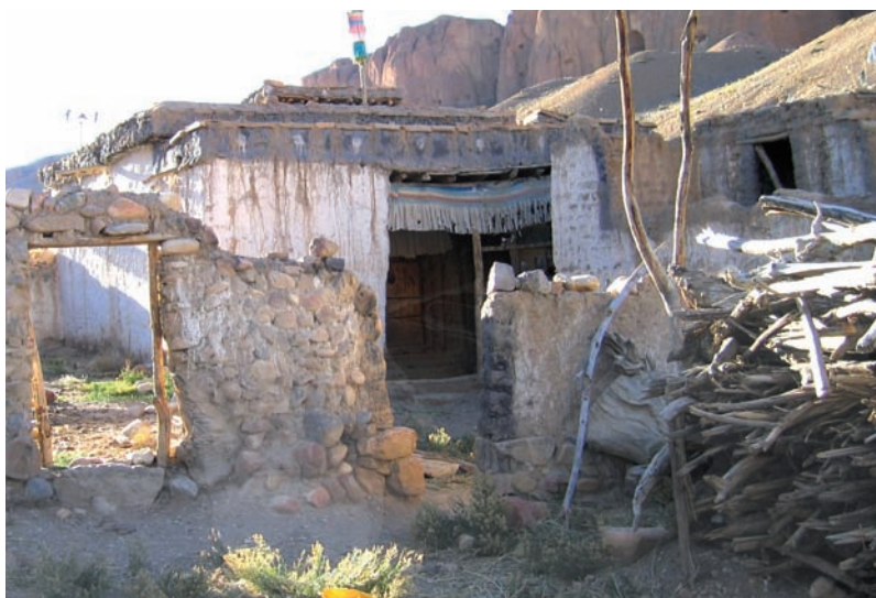
5. Maitreya Temple (Byams pa lha khang)

The historical importance of Khartse is already attested in the hagiography ( rnam thar ) of lo chen Rin chen bzang po (cited at the beginning of this article from a middle-length version). According to the extant versions of this text, the Great Translator belonged to the Hrug wer clan which had a strong presence in the Khartse area. Its thirteen ancestral branches ( pha sgo bcu gsum ) are still part of the oral traditions of the area and live on in the aristocratic lineage of the Khartse ‘king’ ( rgyal po ) to this day. Rin chen bzang po’s hagiography also mentions his subjugation of female local deities and demons and their subsequent appointment as guardians or protective deities of temples founded by him in the Khartse area (see below).