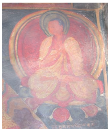
29. Portrait of Zhi ba 'od in mKhar rdzong Cave (main/north wall)

This cave, too, is possibly the only sanctuary within a large complex of caves (c. 30–40, each measuring c. 2 m x 3 m). Its name is derived from the castle whose remains have survived at the top of the cliff. While the religious programme with an emphasis on portraits of the teachers is