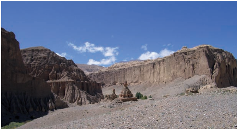
1. Khartse Valley

From the 10 th century onwards, a large number of Buddhist temples and monasteries were founded in the area which constituted the political domain of the kings of Purang Guge (Pu rang Gu ge) 2 in Western Tibet (mNga' ris). Members of the royal lineages and their aristocratic allies played a vital