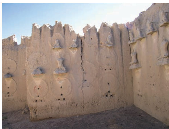
14. Fragmentary remains of the internal decoration of the temple with sculptures in clay