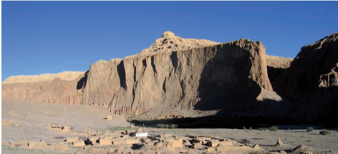
4. Old Khartse Village

Old Khartse Village is the centre of the winter place (Fig. 4). The village lies stretched out on a plain in the secluded valley, with a steep cliff positioned like a curtain behind it. Among the low mudbrick buildings merging with the arid surrounding landscape, the Maitreya temple is specifically embellished and honoured by the white colour of its exterior walls.