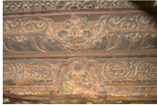
7. Detail, wooden portal with a protector deity (rNam thos sras) at the centre of the lintel

Lahoul is of special significance. While the doorframe may stem from the early Buddhist phase of the valley or slightly later (11 th –13 th c.), the present interior decoration is clearly from a later period, possibly dating from the 19 th century.