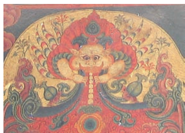
30. Detail of the torāṇa ( kīrttimukha ) above teacher