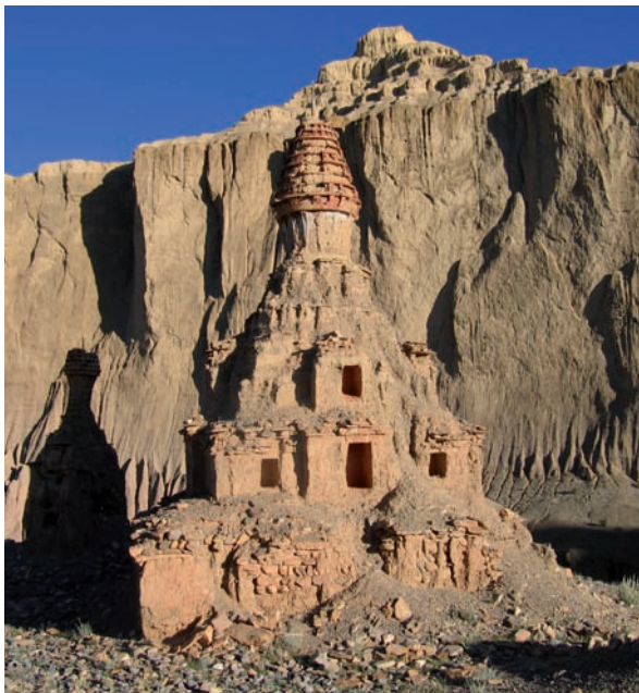
12. Medieval stupa at Khartse (note the images of deities and ornamental features in clay on the spire)

A remarkable group of stupas is positioned on the top of the hill above Khartse close to Khartse Monastery. One of the stupas (Fig. 12) is particularly interesting, as it has survived in an evidently unrenovated state and thus provides an important document of the original 11 th -century