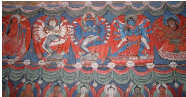
39. Detail of the uppermost row: different forms of Hevajra