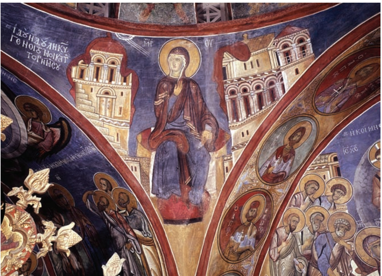
Fig. 4: Lagoudera, Panagia tou Arakos. Fresco of the Annunciation, detail, the Virgin's house