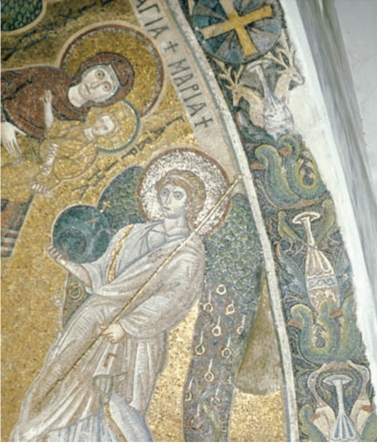
Fig. 1: Kiti, Panagia Angeloktistos, apse mosaic. Border with fountains