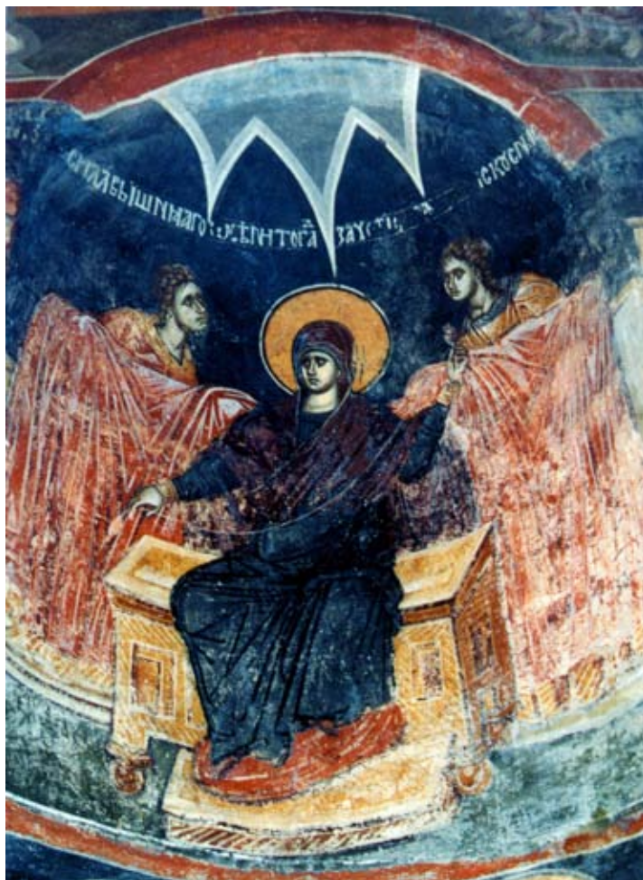
Fig. 5: Marko, St. Demetrius. Akathistos, stanza 4