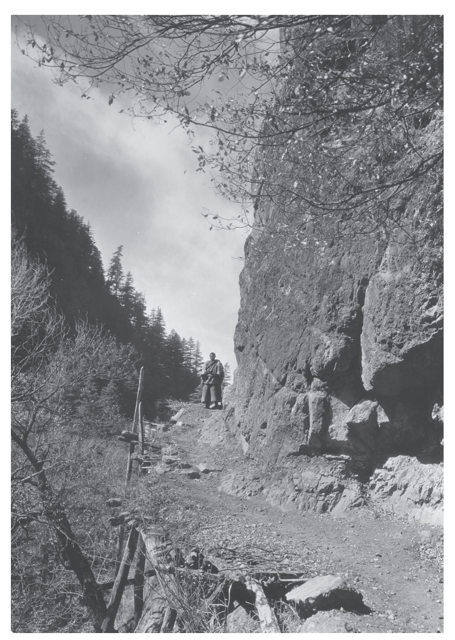
31 (p. 89) Trail in the valley of the Pai-lung Chiang around a cliff built on posts and sticks with the river roaring a hundred feet below. Between Pe-zhu and Ni-shih-k'a in Lower T'iehpu Land.