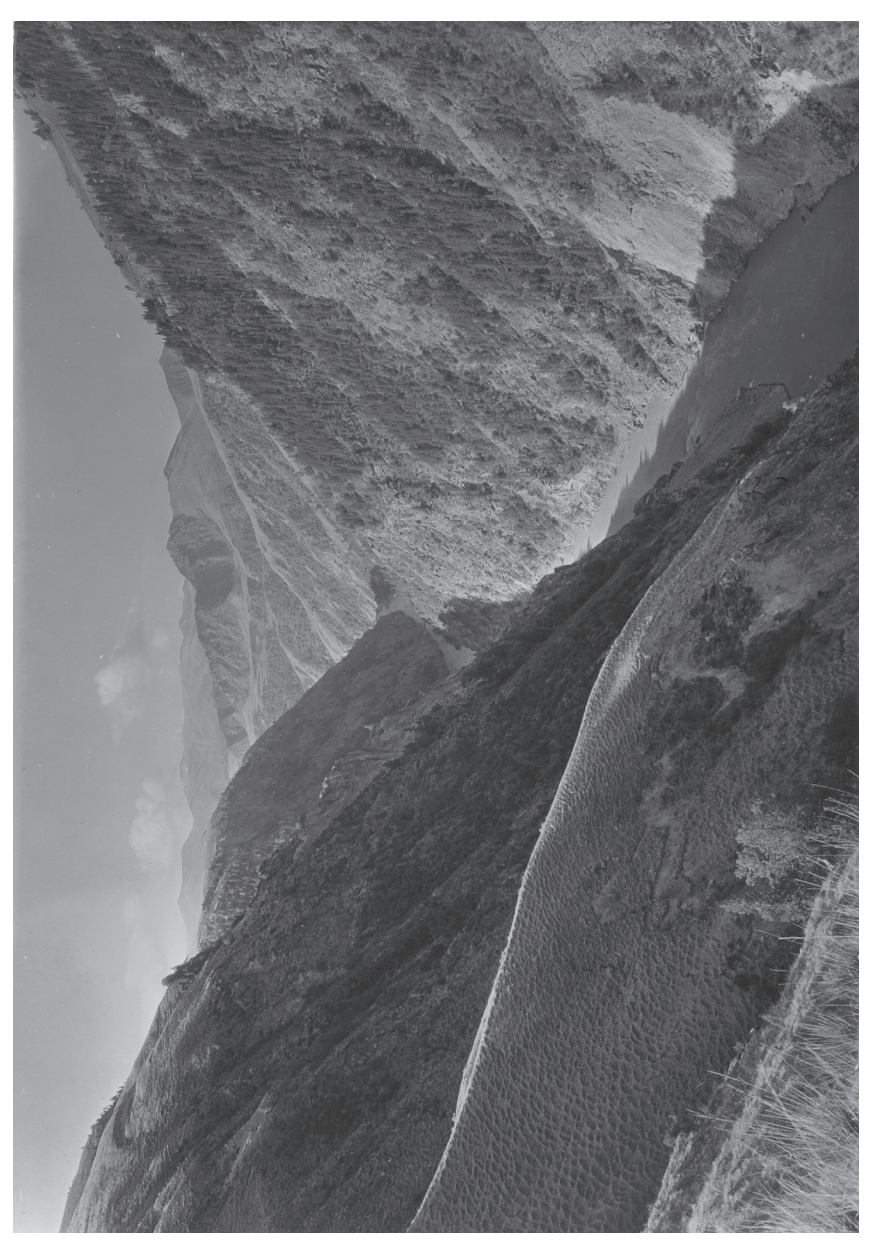
59 (p. 177) The Valley of the Yellow River looking up stream, south-east from a bluff above Ta-ralung, between Hao-wa and Sa-khu-tu valleys, elevation 10600 feet. The valley walls to the right are forested with Picea asperata Mast. The wrinkled appearance of the slopes to the left is due to overgrazing.