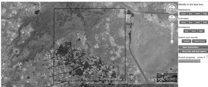
Fig. 1: Geo-Wiki hackathon user interface

(referred to as a hackathon) to rapidly collect data as part of the international initiative RHOK (Random Hacks of Kindness – Hacking for Hunger), organized by USAID (U.S. agency for international development) in October 2012. Registered users were guided to pixels of 1km 2 and were asked to identify the presence of cultivated land and settlements in samples taken from Ethiopia, along with their confidence in doing so. The Geo-Wiki is based on the Google Earth browser plug-in overlaid with the pixel outline of the samples generated in the PostgreSQL/PostGIS database. User feedback is collected using a simple user interface, requesting the user to indicate high, medium, low, or no presence of cultivated land and settlements inside the pixels. In addition, the user has to indicate certainty over the selected options. After submitting the selected options the system automatically guides the user to the next sample pixel to repeat the actions. The system was designed such that at least two volunteers were sent to the same location, in order to increase confidence in the provided information. Figure 1 shows a screenshot of the Geo-Wiki user interface for a sample pixel in Ethiopia.