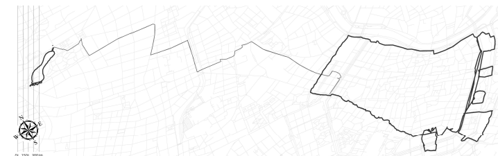
Fig. 2: Footprints with a connection between (Anja Heger, Jenny Daxböck & Antonia Hofstädter)

The project “footprints” had the intention to impose footprints of different scales on the city of Vienna to show different relations and spatial meanings of several regions. While a small footprint was written into the group’s daily used space, the inner city of Vienna was surrounded by a large representation of a footprint. The large footprint was drawn using both public transportation and walks. The project shows preferred locations and the distances between them.