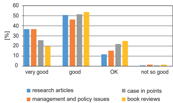
Figure 3 – Ratings of the quality of the articles. N = 136

are interested in reading articles about mountain protected areas in the Alps specifically. The results show that it was, by and large, participants who appreciate eco.mont who took part in the survey, and so we must work harder to become visible outside of this community.