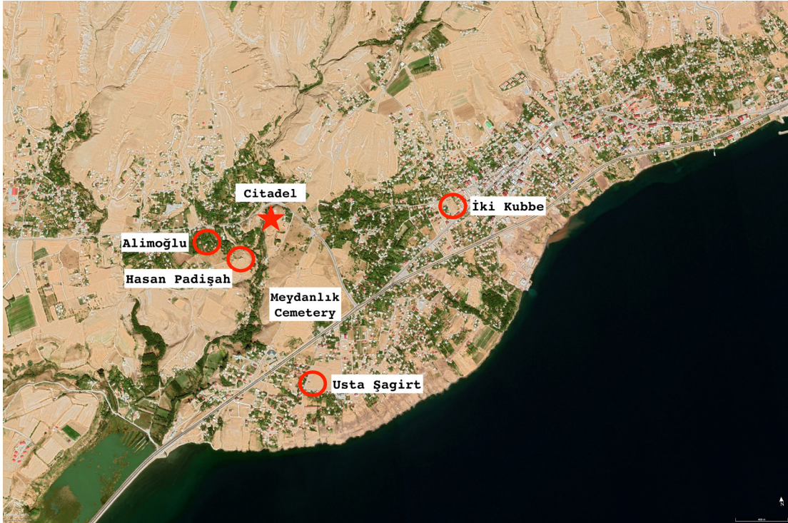
Fig. 4: Satellite view marked with locations of the Ilkhanid tomb towers