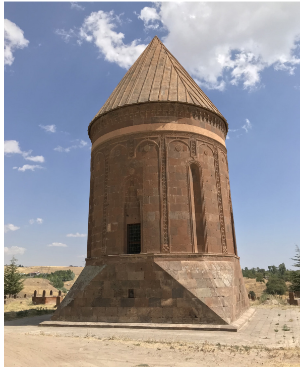
Fig. 7: Hasan Padişah tomb tower, view from the south (photo by the author, September 2018)