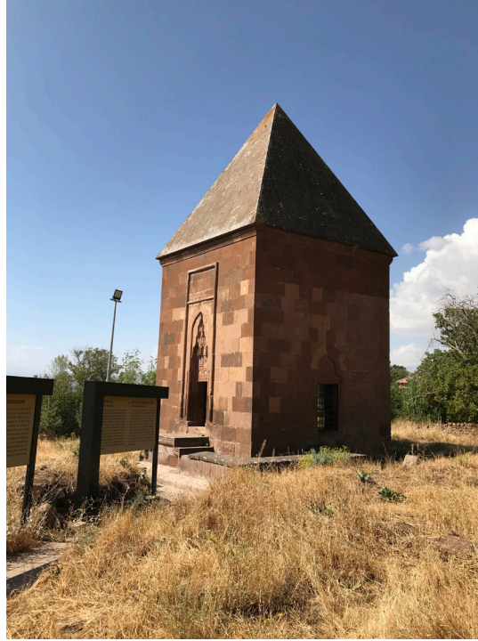
Fig. 5: Tomb of Şeyh Necmeddin (September 2018)

At least four other zāwiya s were similarly located in the outskirts of Ahlat and conceivably may have been founded around the same time as that of Şeyh Necmeddin. These include the zāwiya of Şeyh Abdülkadir in a village called Pağdos, the zāwiya of Kırklar in an eponymous settlement (with a medieval cemetery containing some thirteenth-century tombstones) to the northwest of the medieval citadel (Fig. 2), the zāwiya of Baba Merdan to the north of the city on the road to Malazgirt and the zāwiya of Şeyh Yoldaş, recorded as being »near Ahlat.« 62