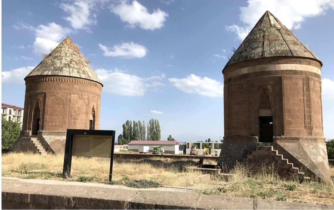
Fig. 12: İki Kubbe tomb towers, view from the north (photo by the author, September 2018)

The Būghātāy Āqā-Shirīn Khātūn tomb tower is the last dated funerary monument to be built in Ahlat for an Ilkhanid amir. It is, however, architecturally very similar to a tomb tower built nine years later in Güroymak (formerly known as Norşin and Çukur), a settlement about 70 kilometers west of Ahlat. The inscription of this tomb tower names Qarandāy Āghā, styled al-amīr al-kabīr malik al-umarā' («the great amir [and] king of amirs») and gives his date of death as the fifth of Sha'bān 689 (13th August 1290). 84 Unlike the Ahlat inscriptions, which name two or three generations of a family, the inscription in Güroymak is silent on Qarandāy Āghā's father or grandfather. In the phrase following his name, the inscription states that «he passed from the abode of annihilation ( dār al-fanā' ) to the abode of mercy and subsistence ( dār al-baqā' wa'l-raḥma ) [as] a Muslim and a proclaimer of the unity of God ( muwaḥḥid ).» 85 This emphasis on his confessional state, coupled with the omission of his father's name, strongly suggests that Qarandāy Āghā was himself a convert to Islam. Constructed about a decade after the İki Kubbe tomb towers, the Qarandāy Āghā tomb is clearly the product of the same architectural workshop or venture, transplanted to a nearby town. The remains of the lower part of another tomb tower located to the south of the Qarandāy Āghā tomb shows that the pattern of paired tomb towers observable in Ahlat also applies here. 86