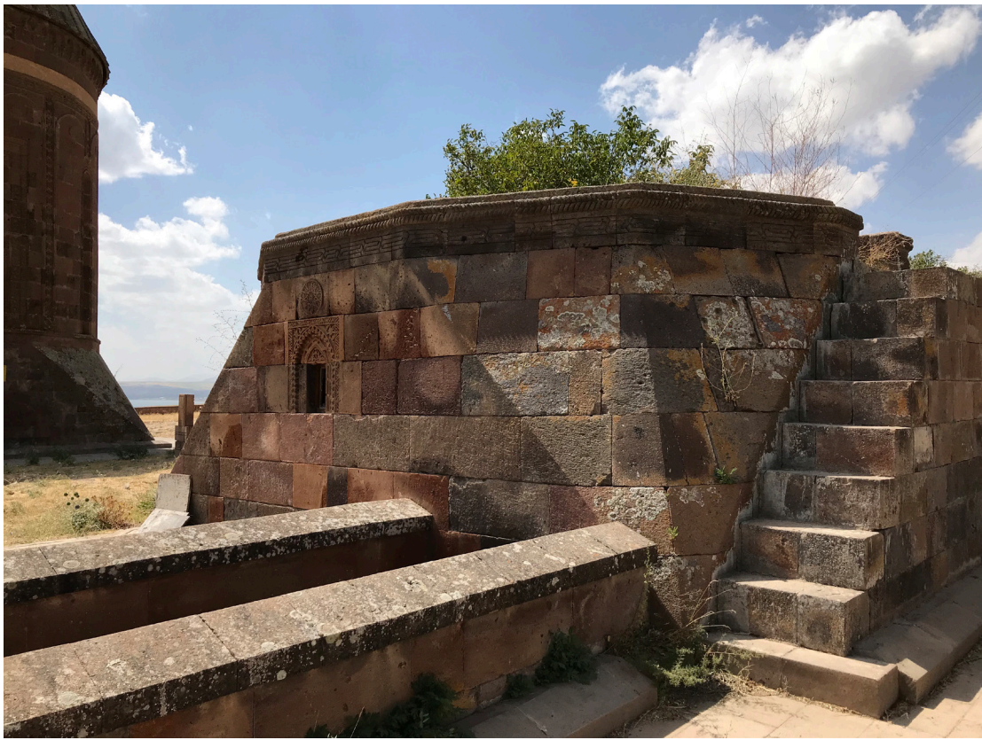
Fig. 8: Base of a tomb tower near Hasan Padişah, view showing stairs and entry to crypt constructed in restoration work (photo by the author, September 2018)

Some twenty meters to the north of the Hasan Padişah tomb is the lower part of another tomb tower which evidently collapsed at some point ( Fig. 8 ). 73 The architecture of the extant base is similar enough (albeit smaller in size) to that of Hasan Padişah that it seems reasonable to assume that they were built approximately around the same time. Judging by the decoration of its lower chamber windows, which are the most decorative of all the examples in Ahlat, this tomb tower must have been at least as fine as its companion, the Hasan Padişah tomb. Without any inscriptional identifier, however, it is not possible to establish its relationship to Ḥasan Āqā b. Maḥmūd but, as is the case with the other pairs of tombs in Ahlat, it is probable that some familial relationship informed the construction of these two tombs next to each other. Located on a high and dominant site with broad views onto the citadel, Harabe Şehir and beyond, these two tombs would have been the most easily visible markers on Ahlat's landscape.