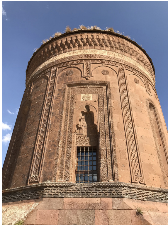
Fig. 10: Usta Şagirt tomb tower, view from the south (photo by the author, September 2018)