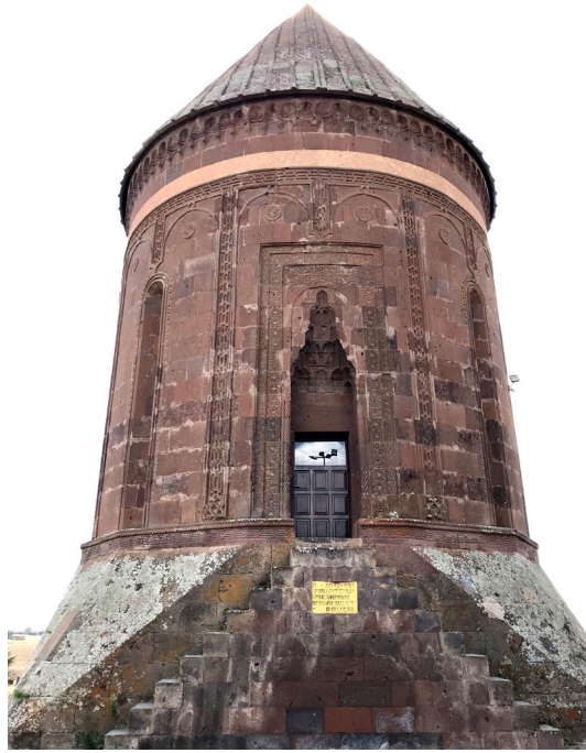
Fig. 6: Hasan Padişah tomb tower, view from the north (photo by the author, September 2018)