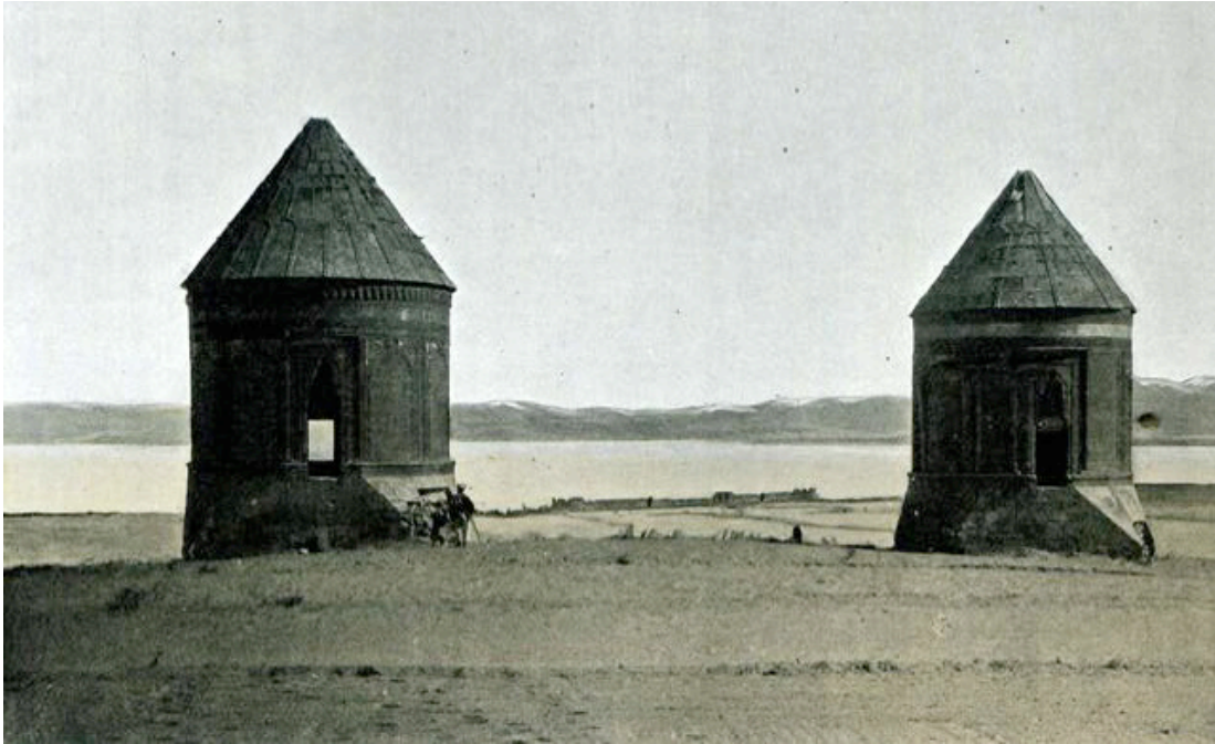
Fig. 11: İki Kubbe tomb towers, view from the north with the Ottoman citadel in the distance