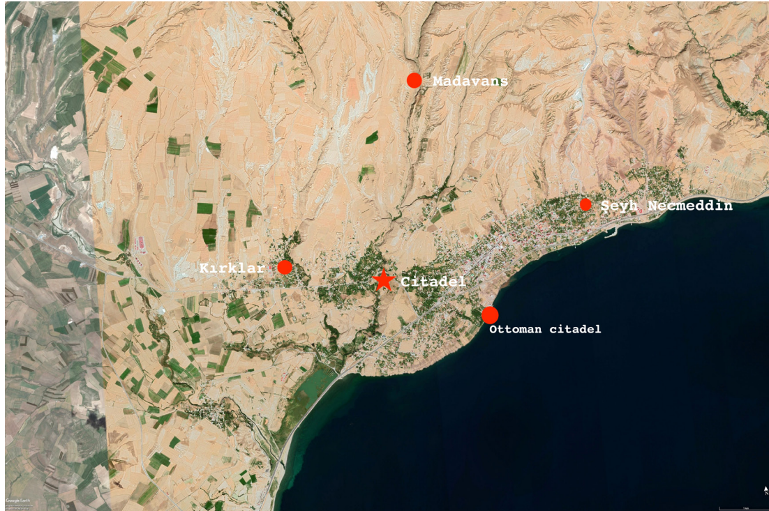
Fig. 2: Satellite view of Ahlat and environs (Source: Google Earth view, 30 September 2019)

The Armenian historian Vardan Arawel'ts'i, who praised the Shāh-i Arman Sukmān II for his benevolence to Christians, recounted the story of an Armenian priest named Awet who became a wandering preacher caring for the dispossessed and crossed paths with Sukmān II who paid him great honors. 39 Subsequently falling victim to the slanders of priests, Awet was stoned to death, but the miraculous appearance of a divine light over his dead body evidently persuaded Sukmān II to arrange for the veneration of the saintly preacher's bones. An anonymous and unepigraphic tomb tower in Ahlat, locally known as Keşiş Kümbeti («Tomb of the Monk») and datable stylistically to the late fourteenth or fifteenth centuries, may possibly be a later reconstruction of a Shāh-i Arman funerary monument to this Christian holy man. 40