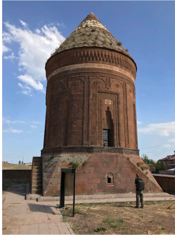
Fig. 9: Usta Şagirt tomb tower, view from the west (photo by the author, September 2018)