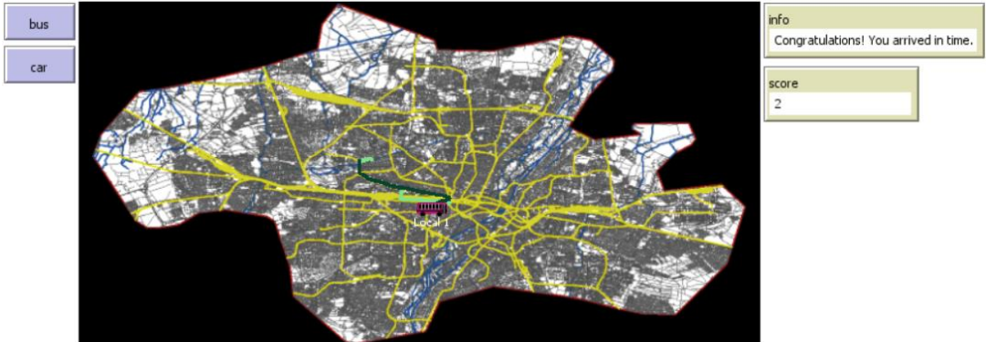
Figure 2: HubNet user interface with information on timely arrival and current score

In scenarios 2 to 5, messages about the allegedly true choices of leaders were displayed on the information monitors of four players. All participants were informed via the monitor as to whether they had arrived at the destination in time or not. An additional monitor showed the player's score throughout the game (Figure 2).