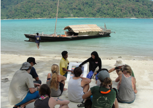
Figure 24: Foreign students in the “Wildland Programs” visited a Moken village on the Surin Islands to experience “Trekking, snorkeling, and touring the village with the Moken.” The map of the village and Moken dive sites were shown to students.