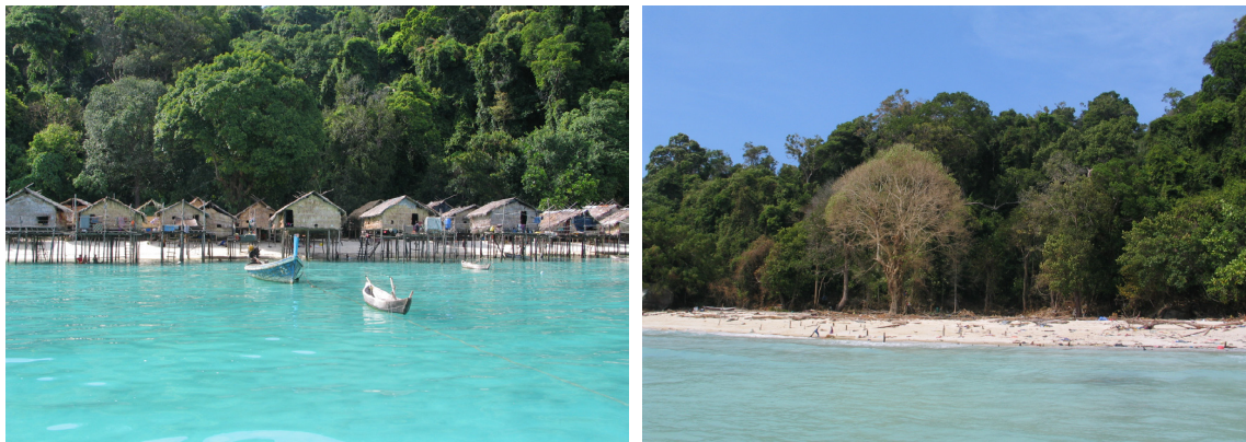
Figure 1-2: A Moken village on South Surin Island before the tsunami. The same village was totally wiped out by the Indian Ocean tsunami of December 26, 2004. However, all the Moken in the village survived by running to seek shelter on higher ground behind the village.

surrounding waters to moor their boats, dry sea products, set fish traps and other fishing tools, and as a playground for children. However, the Chao Lay do not claim private ownership of the land and older generations do not recognise the significance of title deeds.