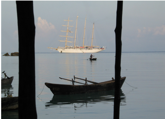
Figure 17: This photo is self-explanatory. Centuries ago, Chao Lay were among very few inhabitants around the Andaman Coast and islands, but 40 years ago they started becoming minorities struggling even to maintain their daily living. The photo shows a large tourist schooner dropping anchor not far from a small Moken village on the Surin Islands in Phang-nga province, with a Moken in the foreground slowly rowing their boat back to the community.

The Chao Lay's plight is not specific to sea nomads in Thailand who are struggling to adjust to their changing world. In this paper their plight serves as a basis for a broader reflection on the situation of indigenous peoples in Thailand in the context of the country's neoliberal capitalist economy facilitated by a bureaucratic state. Apart from the Chao Lay, several other indigenous groups have experienced discrimination and marginalisation in Thailand. The most vulnerable of these at present is an ethnic group in southern Thailand who call themselves the Maniq, or better known in Thailand as Sakai or Ngoh Pa (meaning wild rambutan).