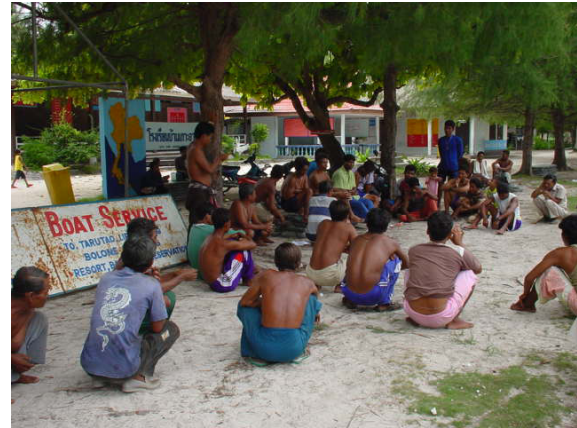
Figure 6: The Urak Lawoi have become sedentary and usually settle in large villages. The photo shows a village on Lipe Island, Satun Province.