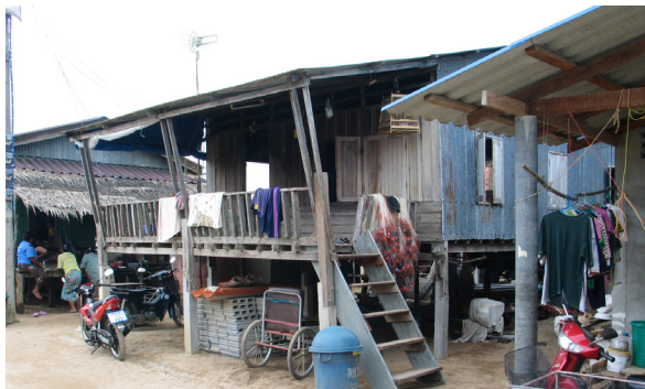
Figure 15: The first generations of Urak Lawoi houses were made of wood and bamboo, with thatched roofs. Later, when they became more settled, houses were made of wooden planks with corrugated iron roofs. When wood became expensive and scarce, then concrete houses were built, with planks and tiled roofs. A popular means of land transport is the motorcycle and sidecar.

All Urak Lawoi have Thai citizenship. The children usually go to the local school, so they are fluent in Thai. Some communities are experiencing loss of language and culture, but those who live collectively with little influence from mainstream culture are able to retain their language and rituals.