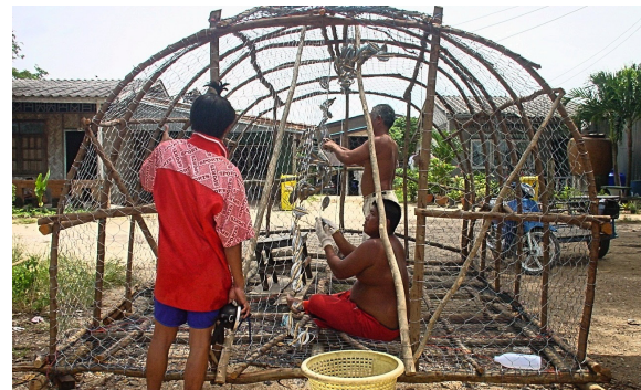
Figure 16: Urak Lawoi fish traps used to be small and hand-made; now they are still hand-made but have become much larger, with the use of new materials like wooden sticks, wire mesh, nylon nets and iron nails.