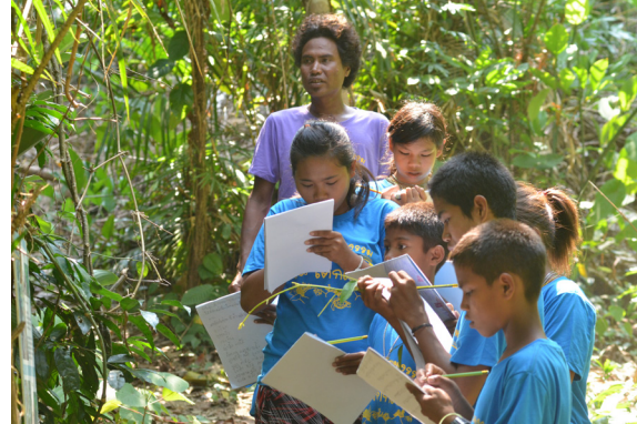
Figure 25: Eco-cultural camps have been organised by researchers in order to promote the passing on of indigenous knowledge to young generations who can now read and write Thai.