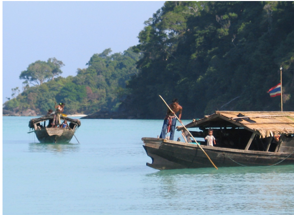
Figure 5: The Moken are the only group who still have the practicing knowledge of boat-building, living and travelling on their traditional boats. The photo shows Moken boats around the Surin Islands, Phang Nga province.

After this brief introduction to the post-tsunami and 2016 media attention for otherwise “invisible” sea-nomads in southern Thailand, the next chapter takes a closer look at the difficult contemporary situation of the three groups of Chao Lay, i.e. Moken, Moklen and Urak Lawoi. In the subsequent section I will argue that the contemporary conflicts and the desperate situation of the Chao Lay in Thailand are driven by three forces: nation-state formation, neoliberal capitalism and the bureaucratic system of Thailand. In the conclusion I will contextualise the situation of the Chao Lay with another marginalised nomadic group in Thailand and describe the need for further research and resulting policy recommendations.