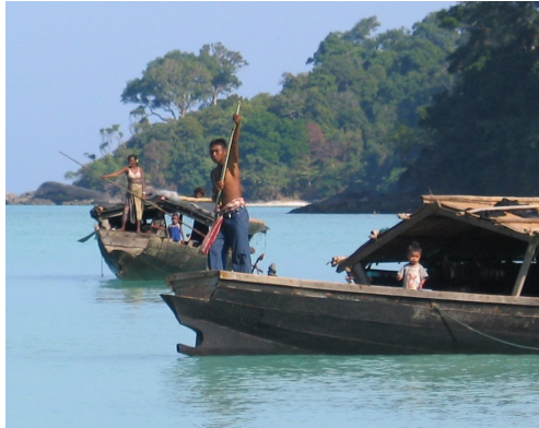
Figure 8: The Moken have traditional boats called the kabang koman or zalacca-wood boat, which they used as a home and vehicle to travel to the islands and coastal areas (photo: Paladej Na Pombejra).

to apply for work in the formal sector, registration for their boats, freedom to travel throughout the country without having to file a request to the authorities, etc. The process for nationality requests is still ongoing, but has been neglected and delayed by local authorities due to bureaucratic rotation of staff and the difficulty and complexity of considering non-documentary data such as family oral history, midwife witnesses etc.