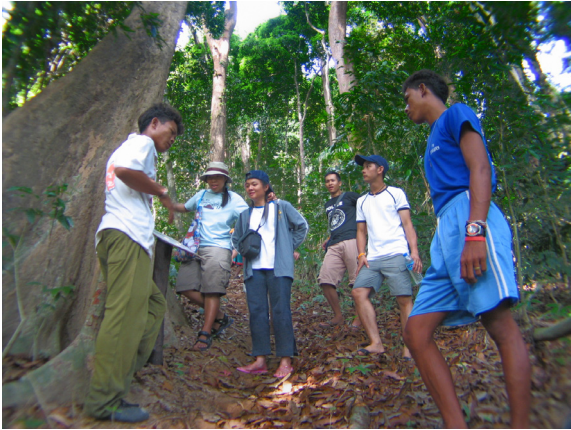
Figure 22: “Trekking with the Moken”, an activity in a small-scale tourism package developed by the Surin Islands community and researchers, still faces several obstacles and gains little support from the National Park Authority despite its promise as an income-generating and resource-friendly activity.

more visible to the society as a whole. 19 Research for empowerment will therefore have to adapt to the needs of this growing movement. Young Chao Lay leaders can now participate or even organise their own community-based action research. It is thus important to support this kind of enabling environment to increase the number of these active young leaders.