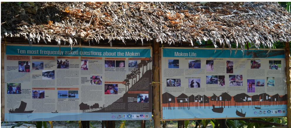
Figure 18: A small hut providing information about the Moken at a village on the Surin Islands in Phang-nga has been set up by the community together with the Chulalongkorn Social Research Institute (CUSRI). It informs visitors to the village about the Moken way of life, livelihood and traditions in the context of the Surin Islands, and answers “ten most frequently asked questions about the Moken”.

Although some information is now available on the Urak Lawoi, the complexity of land disputes (and other problems) clouds public understanding about collective indigenous peoples’ rights in the legal, document-based context. Advocacy research, by contrast, has the potential to provide in-depth understanding of the indigenous dilemma and to expand the analysis to a wider cultural context by including the above-mentioned logics of “Thai-isation”, neoliberal capitalism and the bureaucratic system. In other words, future research needs to focus more on enhancing cultural sensitivity and cultural competency rather than just providing relevant information. Cultural competency must be based on critical anthropological analysis of current socio-economic and political dynamics.