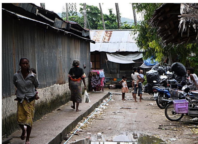
Figure 14: The small entrance to the Moken quarter in Rawai village. As the adults usually go out to paid work, the community is left with the elderly and children during the day (photo: Paladej Na Pombejra).