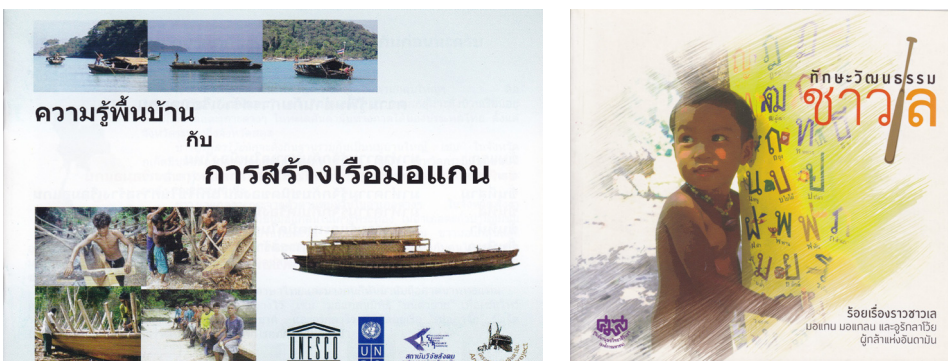
Figure 19-20: The booklet Local Knowledge and Moken Boat Building supported by UNESCO and UNDP illustrates the interplay between knowledge-skills, community relations and the natural environment in the construction of the unique kabang . The book Chao Lay: Cultural Literacy is a result of research promoting cultural literacy about the Chao Lay and has been widely distributed to the interested public.