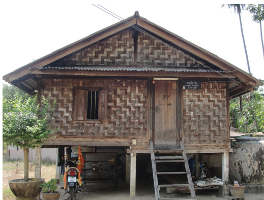
Figure 11: The Moklen have long been a sedentary group who for various reasons occasionally move their villages. Traditionally their houses were made of bamboo and wood with thatched roofs. Now as wood is becoming expensive and scarce, modern concrete block houses are replacing traditional ones.

All Moklen have Thai citizenship, so their basic rights such as universal healthcare coverage and free education are guaranteed. However, there are problems of land insecurity, poverty, and loss of cultural identity and pride. Land disputes are a major problem in several Moklen communities. Residential areas, foraging grounds, sheltered bays and lagoons for mooring boats, and even spiritual sites such as sacred shrines and ancestral graves have been the subject of private claims. Some communities live in the mangrove or beach forests that have later been designated as state-protected areas.