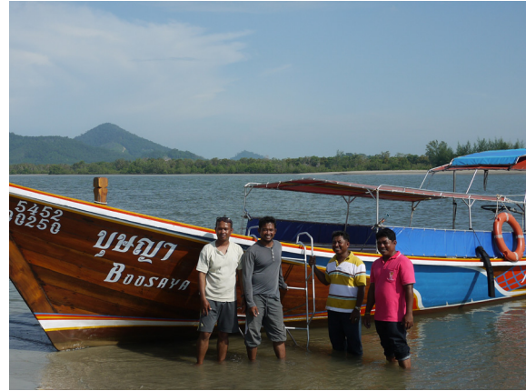
Figure 23: A group of Urak Lawoi on Lanta Island, Krabi Province make an attempt to organise their own touring activity. The boat is usually hired out to tourists for angling and sailing at sunset, but not for a cultural tour, so the research has been conducted to identify interesting points on the route that are related to Chao Lay history and livelihoods.