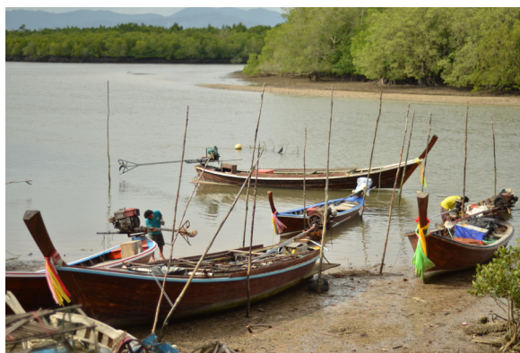
Figure 12: The Moklen have also taken to using local motor boats instead of dugouts as in the old days. The favored subsistence remains fishing and foraging from around the beaches.