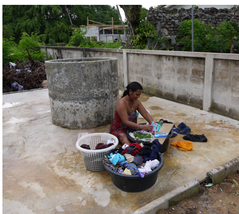
Figure 13: A well near Rawai village, which served as a place for Chao Lay to bathe and wash. It was later filled as the Thai “land-owner” wanted to rent out the plot.

Several Urak Lawoi villages are in areas undergoing rapid tourism development, like Rawai Beach in Phuket, Phi Phi Island in Krabi and Lipe Island in Satun. At present, many households in these three communities are facing serious land disputes and evictions. Communities have been marginalised and fenced off and houses have been pushed further inland to open up beachfront space for tourism as Chao Lay are not usually regarded as belonging in the tourist scenery.