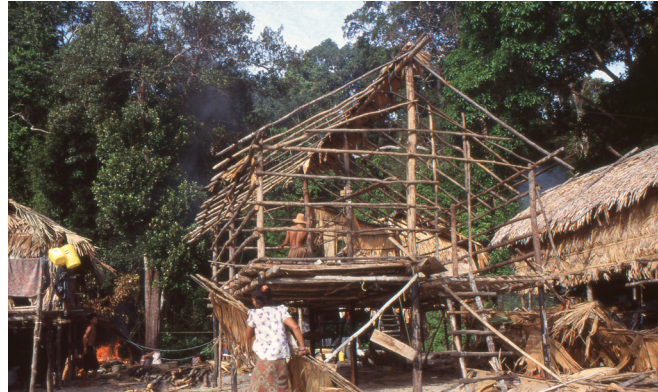
Figure 9: At the beginning of rainy season, the Moken find sheltered bays to build their temporary encampment or huts on the beach.