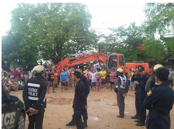
Figure 3: An example of digital news coverage of a land dispute and violence.

The land dispute had long given rise to minor threats for the Rawai Chao Lay, but this violent incident received mass-media coverage and public attention. On January 26, 2016, the company sent in a bulldozer to dump large rocks to block the land entrance but the Chao Lay in Rawai tried to prevent this and to remove the rocks, after which a large group of men hired by the company began beating the Chao Lay, some with wooden sticks (Human Rights Watch 2016). Over ten Chao Lay were injured, two with large bloody wounds to their faces. As a result, twelve years after the tsunami, the Chao Lay have become visible again in the Thai national and international media 3 and their plight regarding land insecurity is now widely known. Since then, they have actively joined with other marginalised groups to plead for their rights and for dignified treatment (Chumchon Thai Foundation 2012).