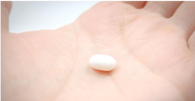
The distinction between restoration and enhancement is blurred

In the absence of scientific evidence, the media may be guiding the public understanding of NE. Also scientists sometimes 'learn' about NE from media sources. Upon having heard of it, people approach scientists working on a particular method and ask whether it could be used for NE. However, current practices of NE are still limited to the clandestine consumption of prescription drugs or the potentially risky application of transcranial stimulation devices. Media reports often grossly exaggerate these practices with respect to effectiveness and the number of people engaging in them. Regarding future enhancement technologies, popular predictions are often inspired by transhumanist speculation or sci-fi visions.